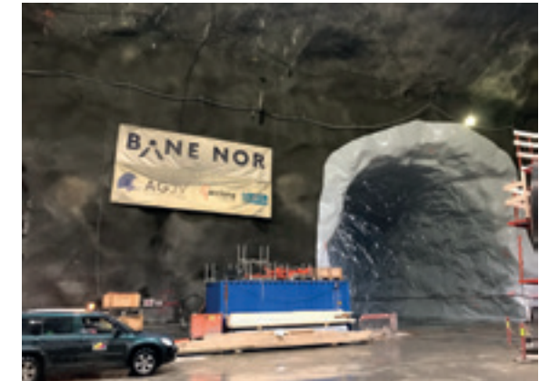
AGJV BANENOR OSLO - FOLLO LINE PROJECT

ches in Denmark, Norway, Switzerland and France, we take part in a number of foreign projects, with a permanent presence in a number of sites. For example, we have acquired another lot in the underground for Denmark, in Copenhagen, and six lots of metro for Paris as well, as part of the Gran Paris Express project. The high level of our work is much appreciated abroad, and always pays us back in the long run. Italy is penalised by a savage market, even though lately we have been recuperating some of the jobs that we had lost as a consequence, sadly, of the collapse of a number of businesses." Mosconi's added value is their elevated specialisation in niche sectors: waterproofing with PVC, TPO, HDPE, bitumen membranes; injections with resin, cement and micro-cement; controlled demolitions, done with hydroblasting, disc cutter and diamond wire machines; redevelopment with mortar, carbon fibre. "We offer our clients continual assistance both during the bidding phase and beyond after the work is secured and, in all these years, we have always been able to supply alternative solutions whenever there was a problem or modifications as the work progressed on site. In our job, we certainly need technical skill, but also a high level of flexibility -, clarifies Mosconi . We always