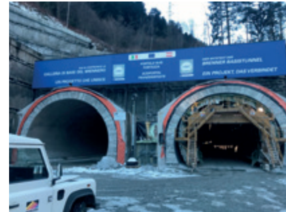
BBT BRENNER BASIS TUNNEL ITALY /AUSTRIA